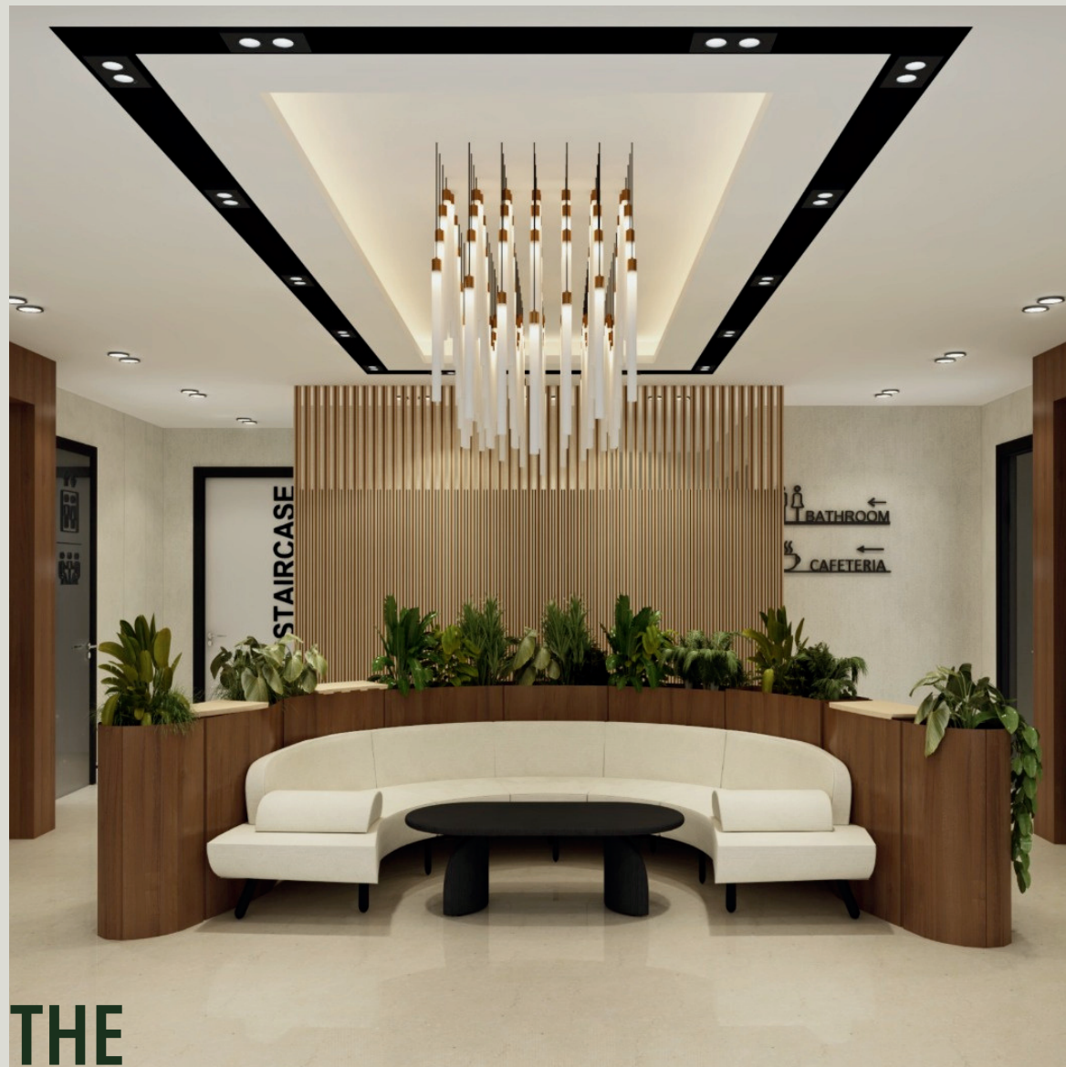
THE GRAND LOBBY

Premium amenities that let you focus on what matters.