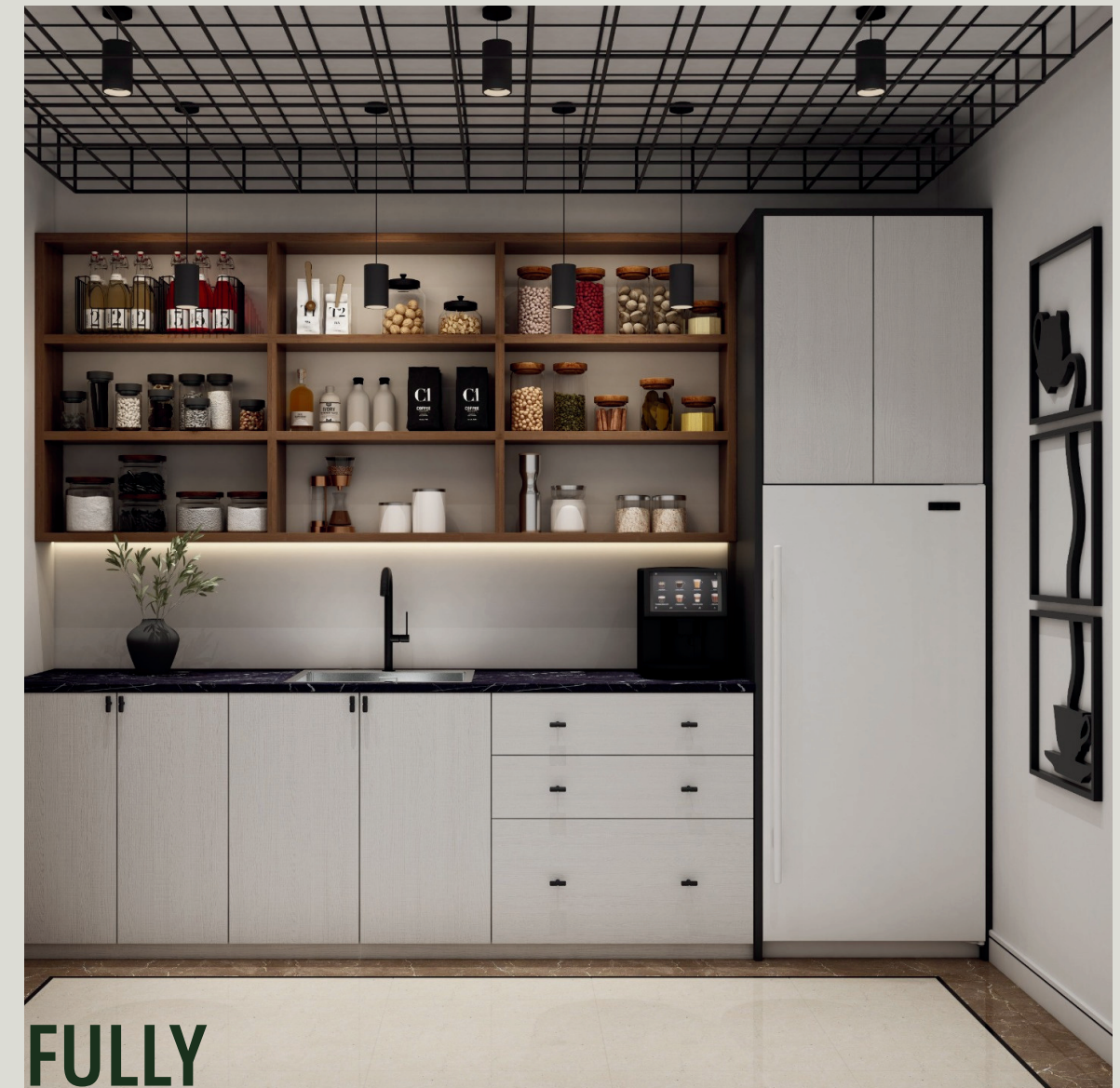
FULLY STOCKED CAFETERIA