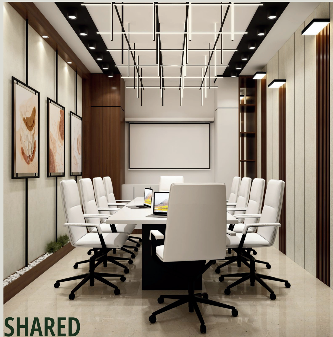
SHARED CONFERENCE ROOMS